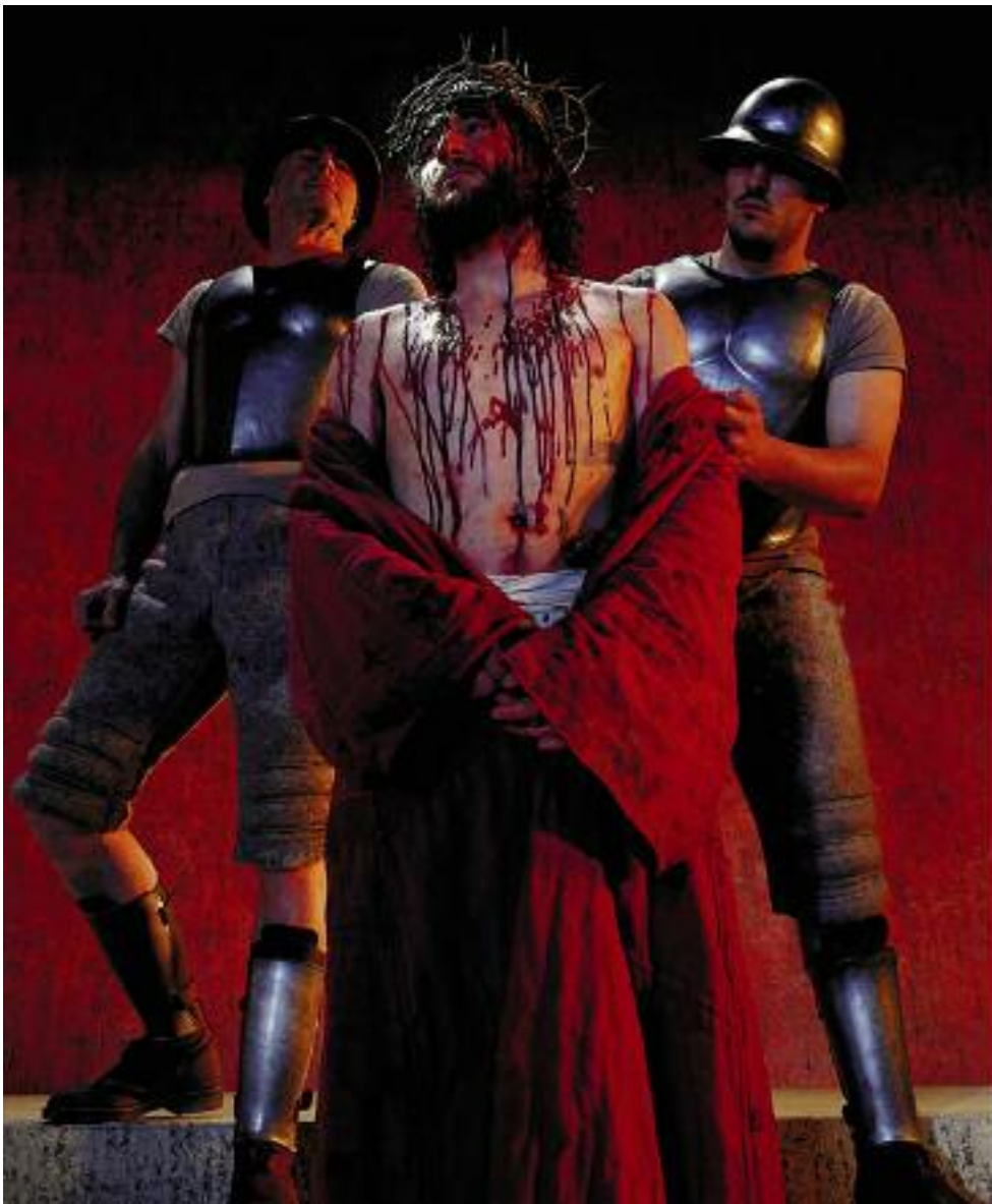
The Oberammergau Passion Play in southern Germany, seen here in its last production in 2000, attracts hundreds of thousands of pilgrims during its five-month summer run.

and actors can't make too many more changes without straying too far from the original material. The blood curse — "His blood be on us and our children" — comes straight from the Gospel of Matthew.