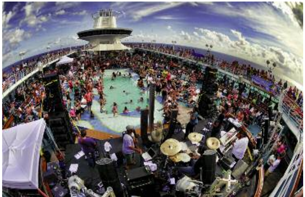
Passengers party during a gospel concert by former American Idol contestant Mandisa during a Premier Christian Cruise on board Royal Caribbean's Monarch of the Seas.

Under the change that took effect Jan. 1, Celebrity will provide religious services only on major religious holidays. Catholic and Protestant clergy will conduct services daily during Lent and on Palm Sunday, Easter and Christmas. A rabbi or cantor will conduct