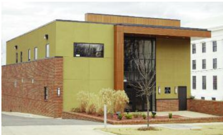
The Dexter Avenue King Memorial Legacy Center, which opened in December 2008, provides office, educational and fellowship space for the congregation that still worships in the adjacent historic sanctuary.